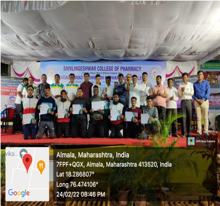
Prize Distribution – Second Runner-Up