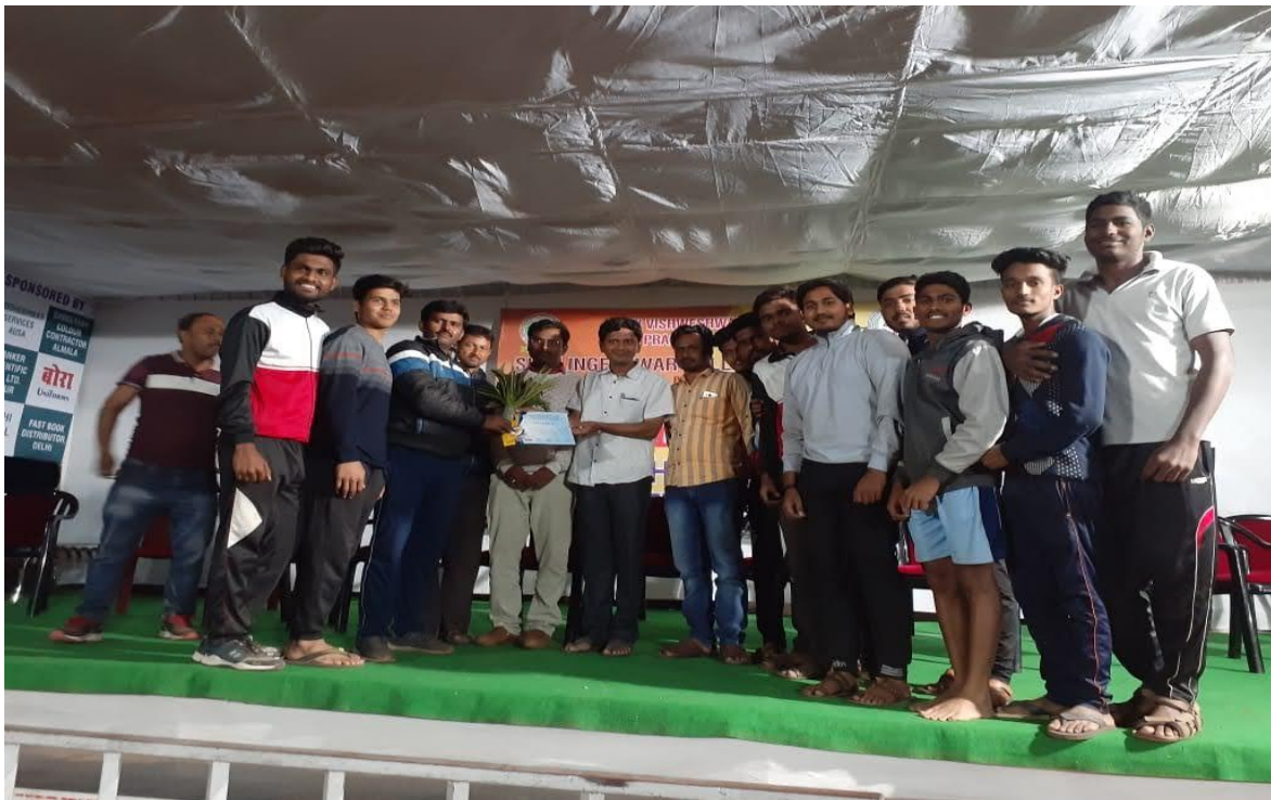
Principal of the College Felicitating Winning Team