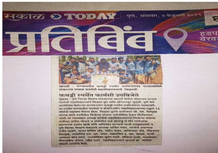
Prize Distribution News in Sakal News Paper