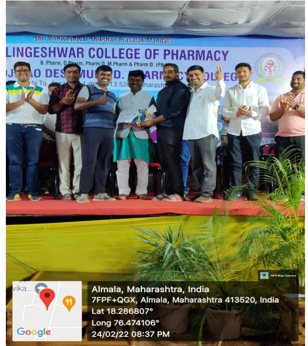
Prize Distribution – Best Lifter of the Tournament

पुणे दि. २५ (व्यवस्थापक) दिनांक २३ फेब्रुवारी ते २४ फेब्रुवारी रोजी आयोजित सातत्या राज्यस्तरीय फार्मा हॉलीबॉल स्पर्धा, शिवलिंगेश्वर कॉलेज ऑफ फार्मसी अल्माला लातूर-औसा जिल्हा-लातूर येथे आयोजित करण्यात आलेल्या होत्या. या स्पर्धेमध्ये संपूर्ण महाराष्ट्रातून एकूण ४४ संघ सहभागी झाले होते. त्यामध्ये शंकरराव उरसळ कॉलेज ऑफ फार्मसी चे पदवी व पदविका विभागाचे दोन संघ सहभागी झाले होते.