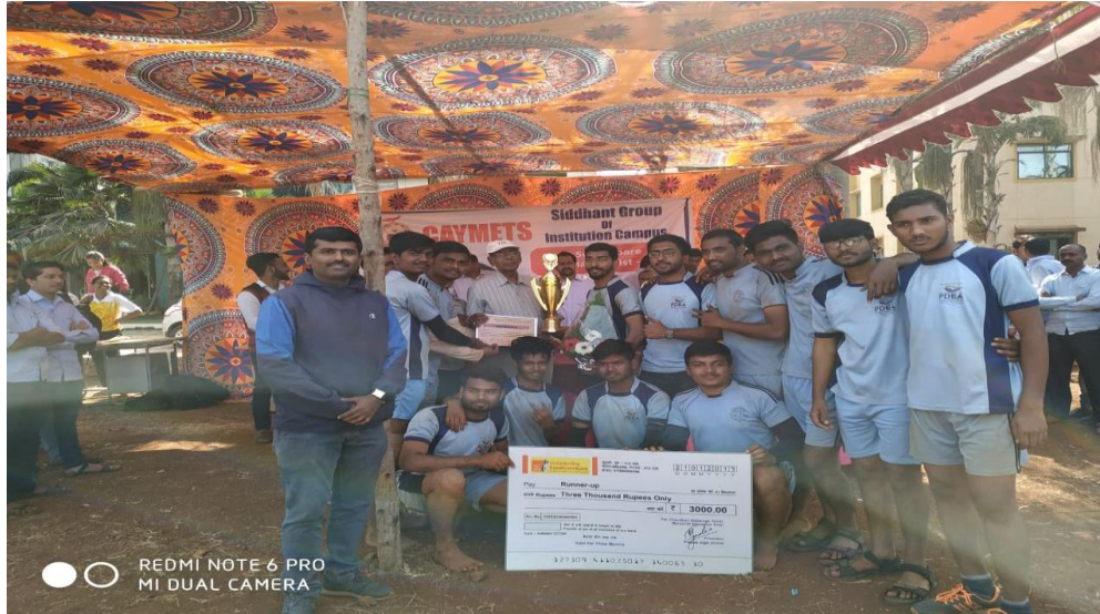
Runner-up Team with trophy and Certificate